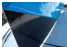
FIXING: DOUBLE SIDED TAPE