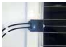
CONNECTION: JUNCTION BOX