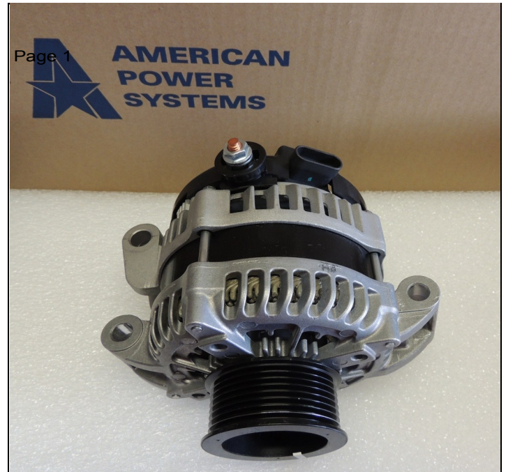
Typical Application—Armored Security Vehicle